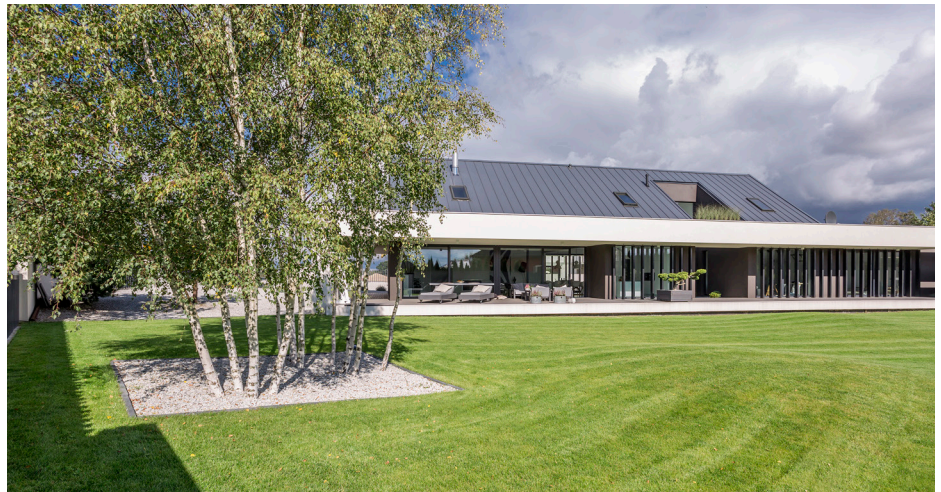
Nursing home meets NZEB requirements with natural gas.

Constant heating supply at a low running cost