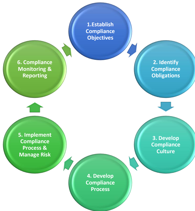
Figure 1: GNI Licence Compliance Framework