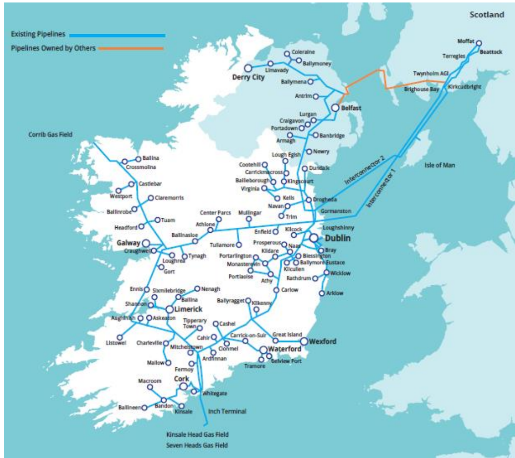
Figure 2.1: NDP Plan Area