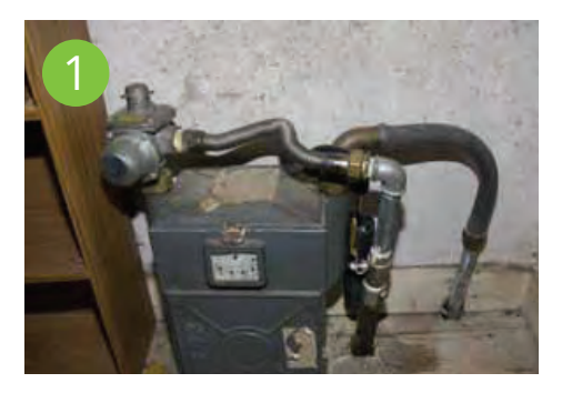
An example of an internal meter which needs to be relocated.