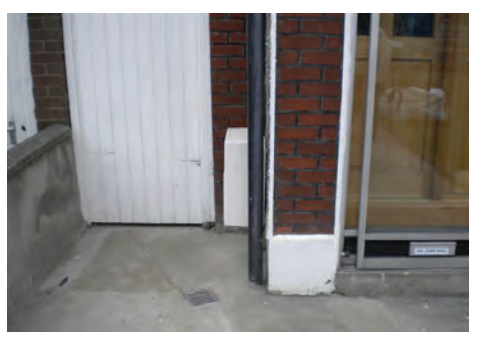
Gas Networks Ireland reinstatement.

Generally, the customer will arrange for the excavations, as this significantly reduces the cost of the job.