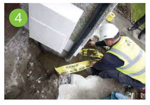
Gas Networks Ireland crew prepare the ground for a temporary reinstatement and will return within 20 days to reinstate the area permanently. (Where Gas Networks Ireland carry out the excavation).