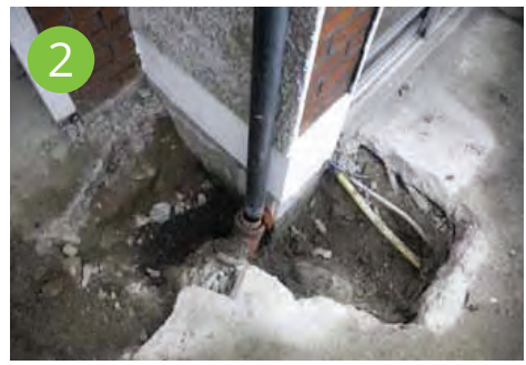
Area excavated to re-route pipework for alteration and meter above.